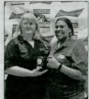
New friendships have come from dart competition.

In addition to all that she encompasses as a single competitor, she shared with me that she has had great success winning Division Championships